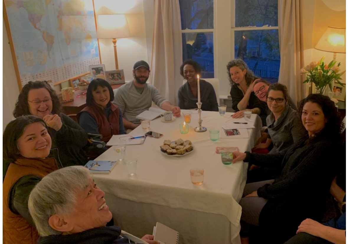
Planning for HOME.

Now in Year Three, Belonging manifests as HOME, and elicits perspectives on cultural identity from among our more diverse - and often least represented - populations, including the homeless.