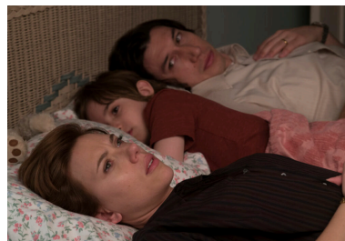
Sierra Watershed Educational Partnerships presents Tahoe Film Festival, its 5th Annual Environmental Film Festival on Thursday on Dec 5-8.