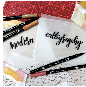
Atelier presents a class on modern calligraphy and hand lettering taught by Kelly Wallis on December 5 in downtown Truckee