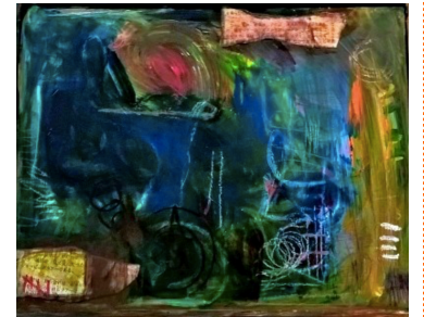
Osborn Woods Gallery presents its Holiday Show, opening on November 29 - Black Friday - at the Miners Foundry.