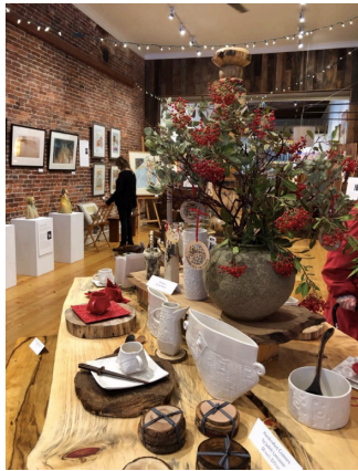
Artisans Bounty at LeeAnn Brook Fine Art this Thanksgiving Weekend

- click on picture for more information -