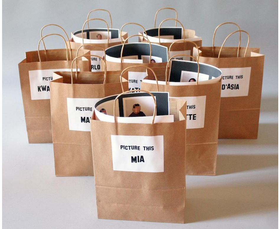
Student artwork as a momento following the completion of this semester's Picture This program

Young people participating in our Picture This program in Grass Valley completed their last lesson and celebrated with more than a cake before the start of their Thanksgiving holiday.