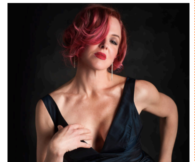
The Center For The Arts presents Storm Large on Sunday, December 8 at 6.30 for 7pm at Veterans Memorial Auditorium in Grass Valley.