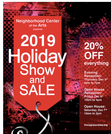
Neighborhood Center for the Arts presents its annual holiday show Mondays-Fridays 10am-4pm.